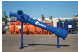
Centrifugal Sand Separators