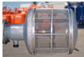
Pump Suction Screens